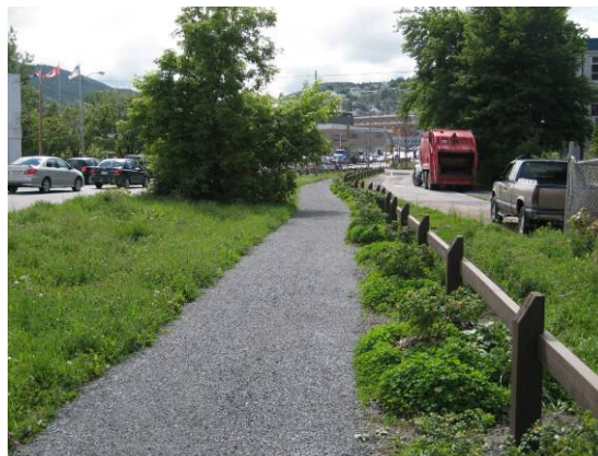
Waterfront Connection to Downtown