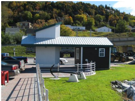
Gateway Kiosk & Plaza

The plaza includes signage depicting the trail network map with photos and text describing the sites and attractions throughout the city. From this area, walking visitors are directed safely into the downtown via the Waterfront Connection trail built on the former rail bed. This trail also features a rest area and interpretive signage describing the history of the Newfoundland Railway and the construction of the adjacent paper mill in the early 1920's.